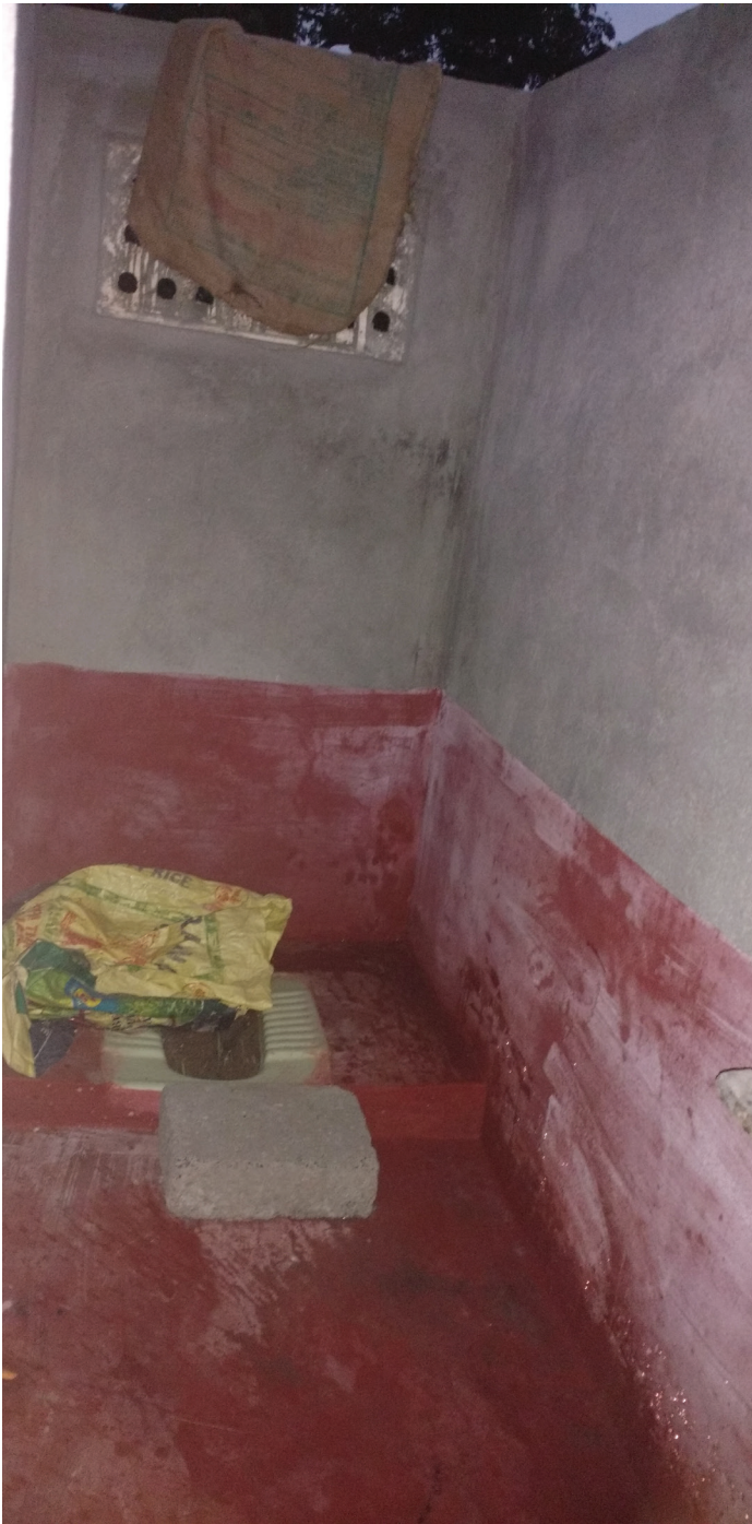
Temporary IHHLs constructed for encroached households

construct IHHLs by contributing physical labour and utilizing the minimum material provided, thus making it possible for each and every household in the GP to have an IHHL.